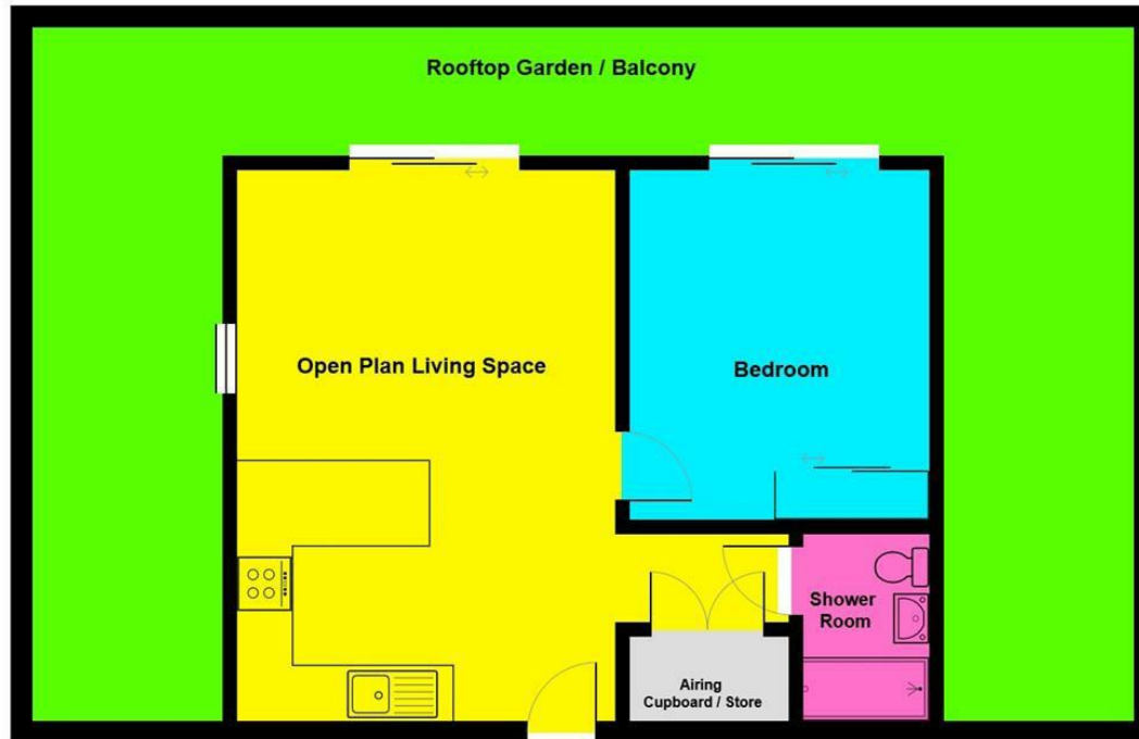
Fleet Court, 25 OLD MILTON STREET, LEICESTER, LE1 3BB

All measurements are approximate and for display purposes only